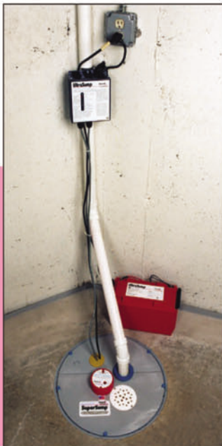
The UltraSump® configuration is reliable and designed to complement a SuperSump®.