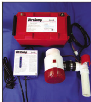
The UltraSump® battery back-up allows you to relax even when you are not home.

As an addition to your SuperSump®, we recommend a back-up pumping system. The UltraSump® represents the state-of-the-art in battery back-up pumping systems. When added as an option to our SuperSump®, the UltraSump® will turn on automatically if the primary pump fails to operate. The UltraSump® includes a second DC operated pump, a second automatic switching system, a 'smart' charging system, and a high-quality 120 amp battery.